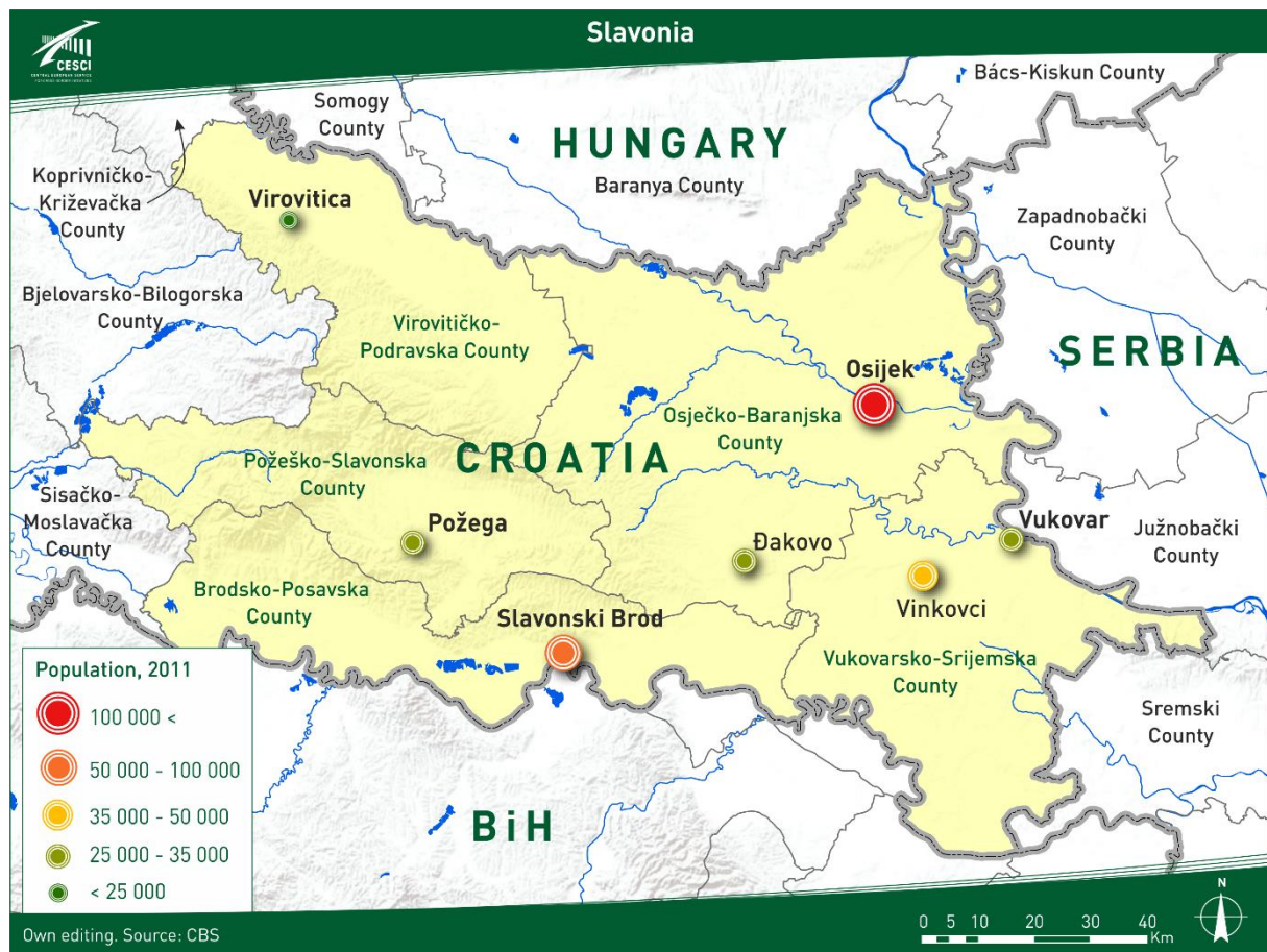
Figure 2: The region of Slavonia

In contrast to this the Hungarian side is much more polarised. The weight of the city of Pécs within the settlement network is more overwhelming, than that of Osijek in Slavonia. Based on the number of inhabitants Pécs (approximately 150 000) is more than twice as large as the second city Kaposvár (65 000) and almost five times greater than the third Szekszárd (33 000). Other municipalities counting more than 15 000 inhabitants are Siófok (25 000), Komló (24 000), Dombóvár (19 000), Paks (19 000), and Mohács (18 000). At the same time, the significance of the entities from the very bottom of the settlement hierarchy also refer to a more imbalanced settlement system than in Slavonia. According to the census of 2011, 497 of the 799 municipalities (or 62%) of the whole region has a residential population of less than one thousand people, and this share of small size settlements was even more significant in Baranya county, the closer hinterland of Pécs, where 258 out of 301 settlements (86%) had no more than one thousand inhabitants. All this points to the decisive role of Pécs as an ultimate centre of the wider area.