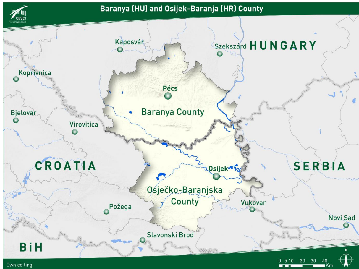
Figure 1: Baranya and Osijek-Baranja

The core of the larger area of the cooperation is largely identical to the historical Baranya/Baranja region, a more or less flat plain between the Danube and Drava rivers. However, the hinterland of the two cities is much larger than this as even the cities themselves are located at the very edge of this plain area (Osijek is practically outside as it sits at the southern bank of the River Drava). It is more appropriate to identify the counties of Baranya and Osijek-Baranja, seated in Pécs and Osijek respectively, as the areas where the spillover effects of the cooperation of the cities is most effective.