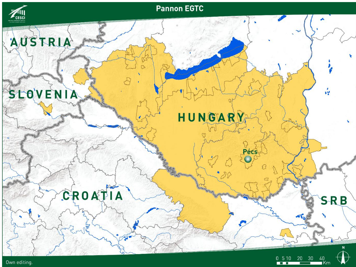
Figure 6: Members of the Pannon EGTC

Beside institutional framework, financial background is another important factor behind successful cooperation programmes. From this point of view the INTERREG/ETC Fund of the European Union is of major importance. The successor of the 2007 – 2013 Hungary – Croatia IPA CBC Programme, the Hungary-Croatia Cross-border Co-operation Programme 2014-2020 was officially submitted to the European Commission on 24 March 2015, after the respective approvals in Hungary and in the Republic of Croatia. The new programme does not intend to contribute to large-scale interventions but to support selected cooperative strategic actions and pilot projects in priority fields, such as enhancing economic cooperation, poor accessibility or the business environment; enhancement and preservation of environmental and natural assets or preventing the risk of loss related to them; fostering the lack of networks among local and regional administrations and improvement of communication between educational and training institutions and key actors of local economy. 18