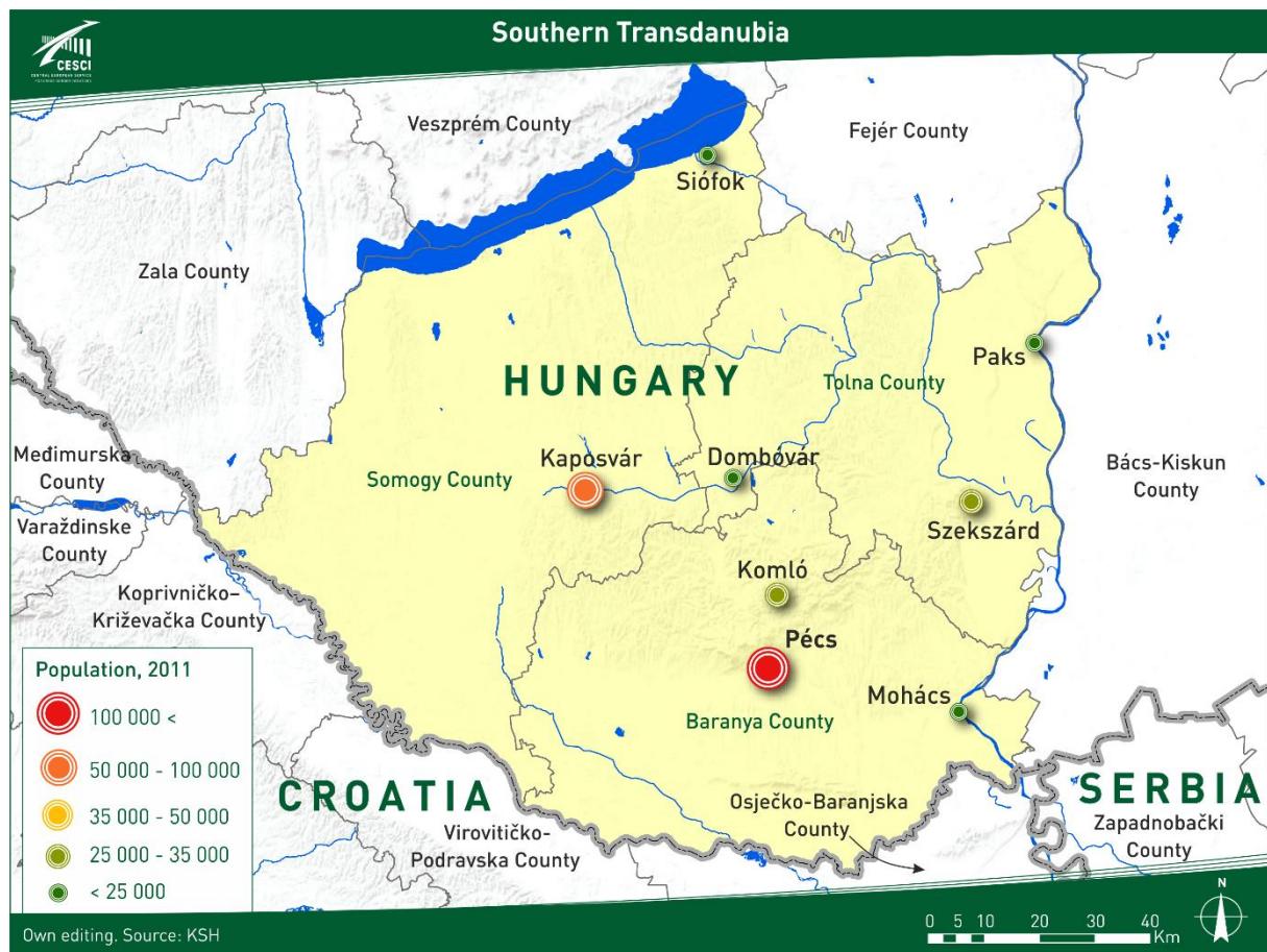
Figure 3: Southern Transdanubia Region

All in all, we can say that the borderland area of historical Baranya/Baranja region is organised around two important urban centres on the two sides of the border. However, the overwhelming weight of Pécs suggests that there might appear some asymmetries concerning economic and social interactions in cross-border terms, in favour of the Hungarian side.