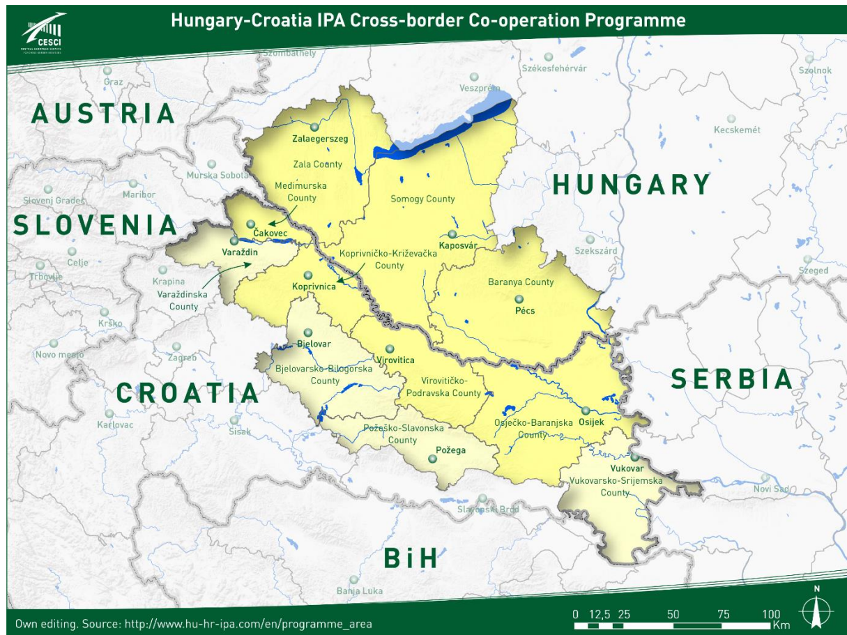
Figure 5: Programme area of Hungary-Croatia IPA CBC 2007-2013

The Programme offered a wide range of opportunities for potential beneficiaries in the frame of two priorities: Sustainable Environment and Tourism as well as Co-operative Economy Intercommunity Human Resource Development. 60% of the total budget was allocated to the first one and 30% to the second one, whilst the rest was foreseen to serve technical assistance. Various activities could be eligible for financing, such as infrastructure developments serving the protection of nature and natural values; elaboration of joint programmes, studies, strategies for the improvement of environmental protection; construction and designation of new cycling routes; development of tourism attractions and of related infrastructural facilities; creating and promoting pathways to integration and re-entry into employment for disadvantaged people; development of infrastructural and equipment capacities in the field of research; preparation of joint feasibility studies, development of common curricula and of joint training facilities; people to people activities like organising festivals, performances, theatrical tours, concerts, exhibitions, art workshops, charity events, cross-border amateur sport championships and tournaments, and activities to reduce the language barrier.