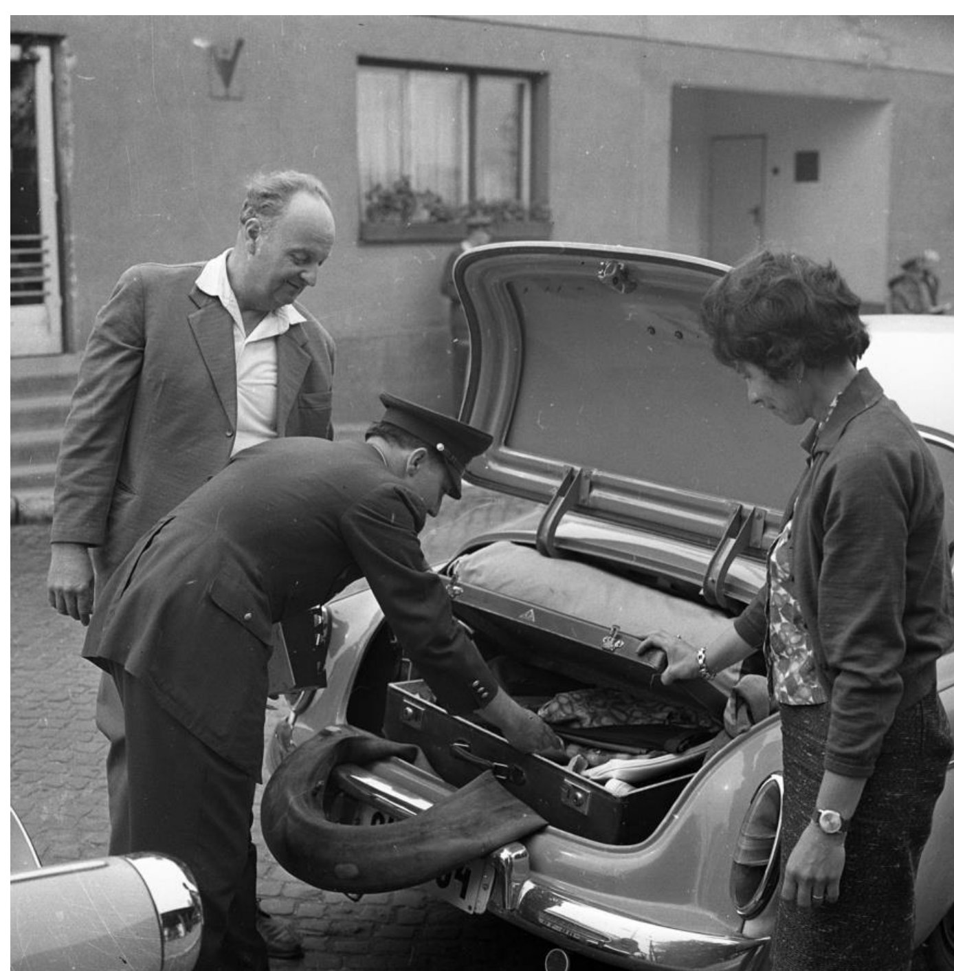
Control on the Czechoslovak-Hungarian border 1960: