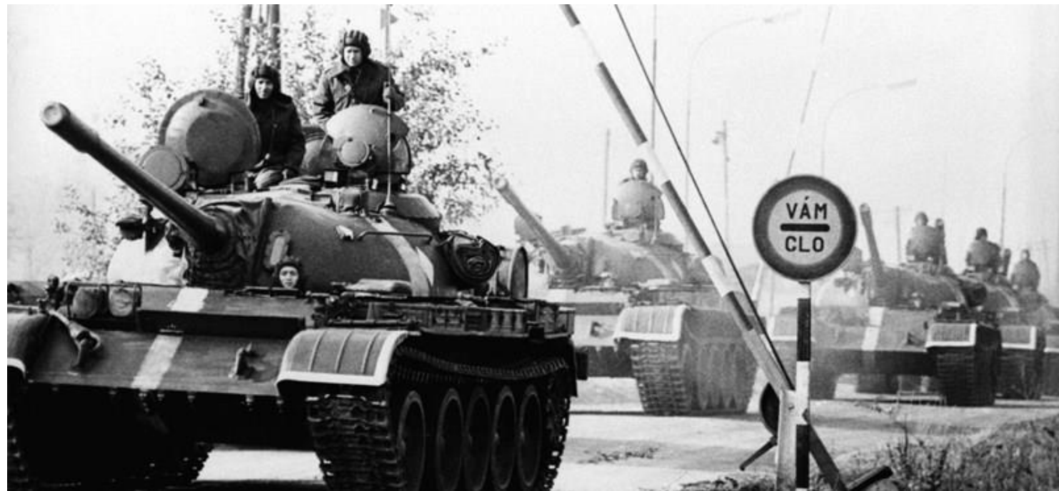
20 August 1968: Invasion of the troops of Warsaw Pact in Czechoslovakia against political reforms The Hungarian People's Army convoy on border area