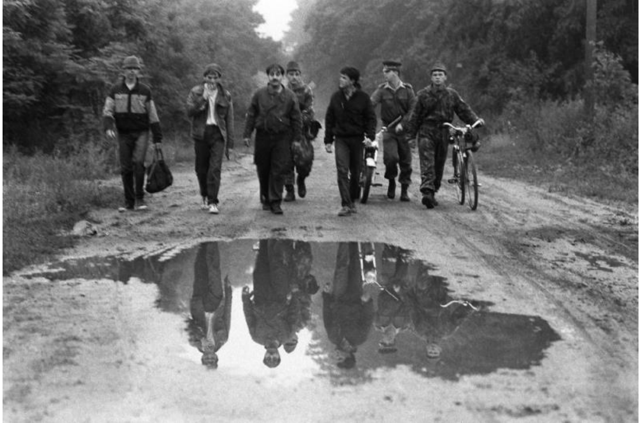
Spring and summer in 1988: Romanian border guards and Hungarian refugees With Hungarian border guards at the time of systematisation in Romania