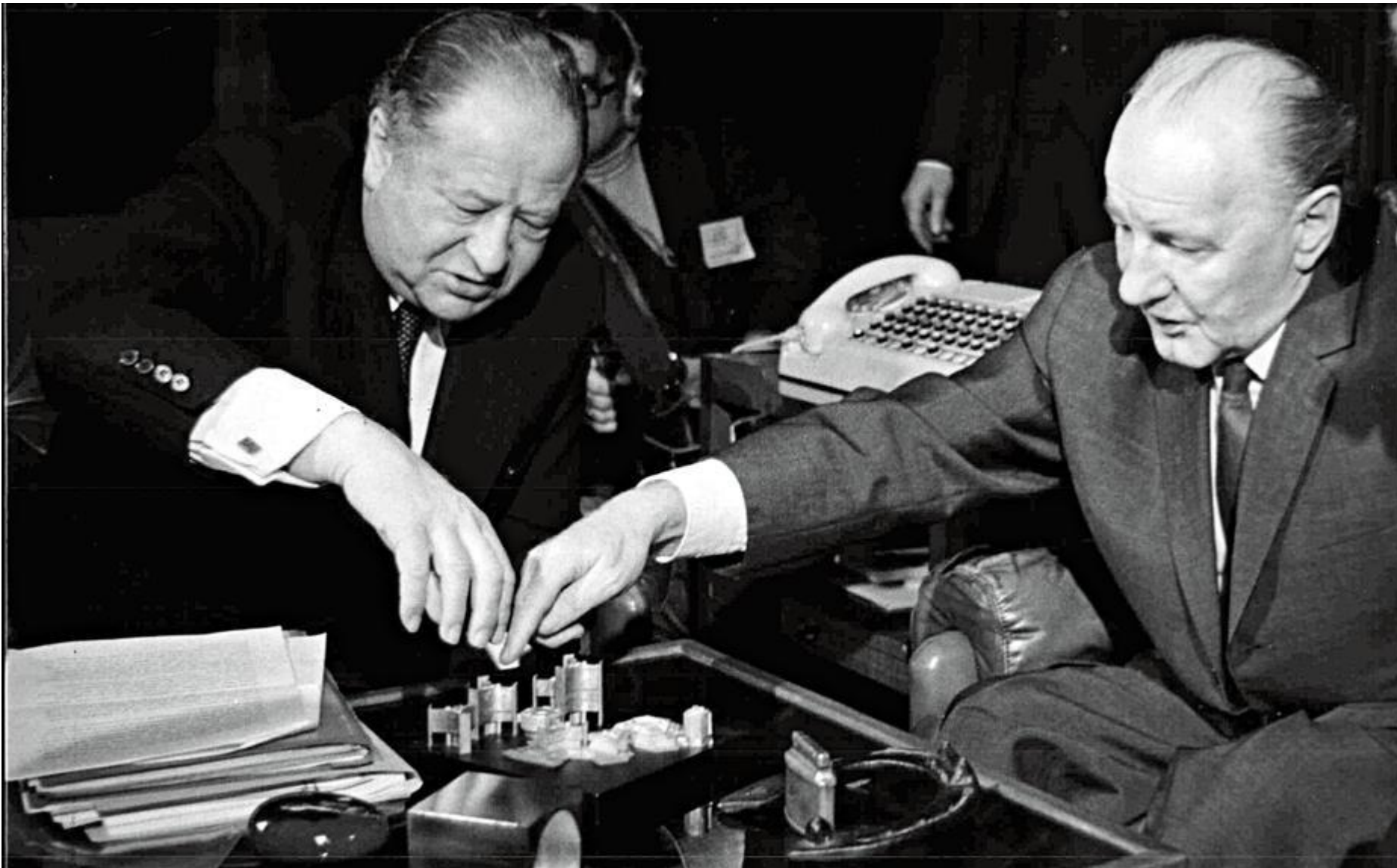
K.u.K: Bruno Kreisky chancellor of Austria and János Kádár general secretary – special Austrian-Hungarian in foreign politics and border connections