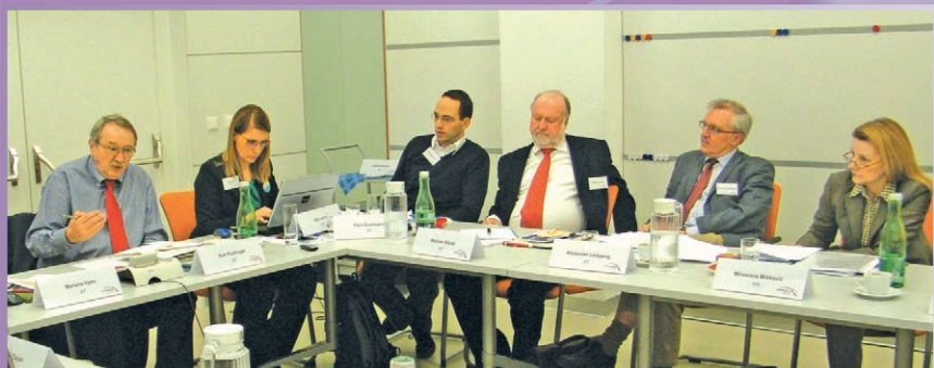
Meeting of the Working Group 3 of Priority Area 10 of EUSDR