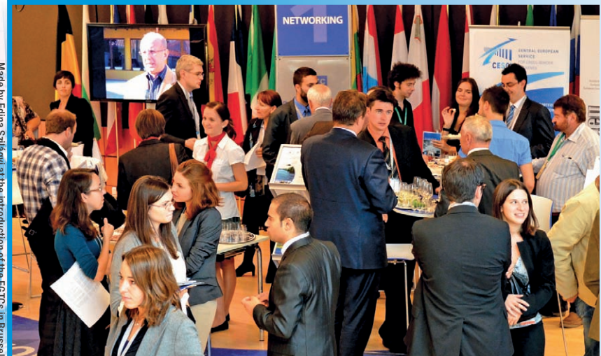
Great interest towards the Hungarian stand

We established the permanent workshop of the EGTCs with Hungarian participation for the sake of coordinating the professional work, planning the joint appearance, mutual transfer of knowledge and the effective representation of interest. The workshop held two meetings in the summer of 2012. In July in Salgóbánya we