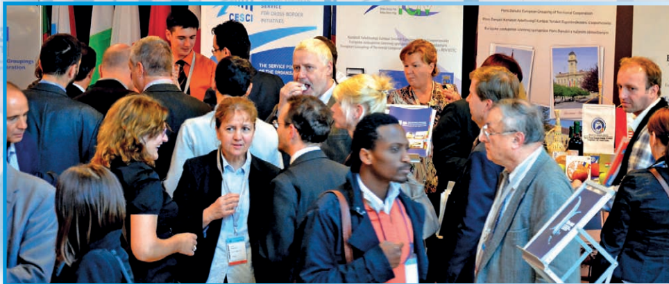
Visitors and EGTCs

Establishment of an European Grouping of Territorial Cooperation (EGTC) in the European Union has been possible since 2007, according to the 1082/2006/EC Regulation. Until the end of 2012, 33 EGTC have been registered all over the Union, 14 out of them have Hungarian members and 11 are based in Hungary. CESCI plays an active role in setting up and launching these innovative institutional solutions and in implementing successful professional work. The main part of these activities consists in preparing and reconciliation of the founding documents, as well as the coordination of the approval and registration process, in all concerned countries.