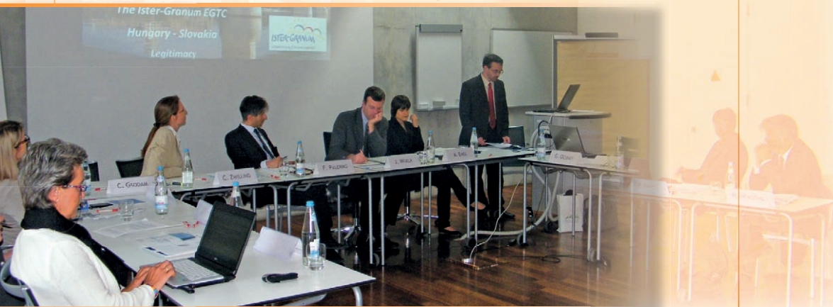
Presentation at the seminar in Bolzano