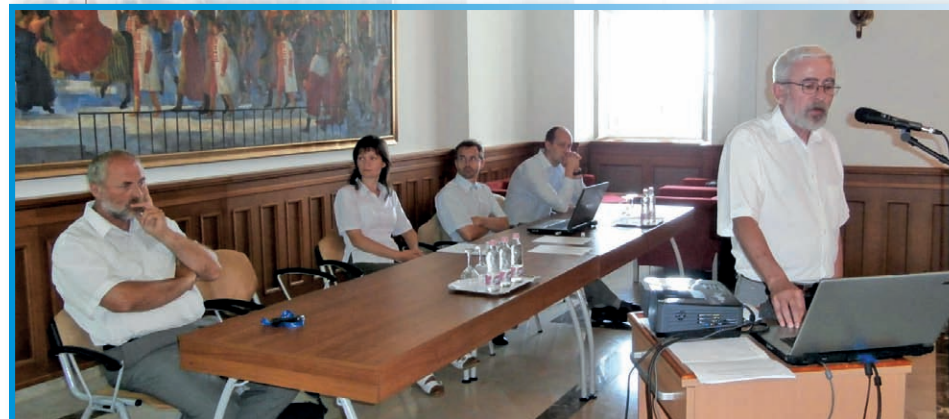
Launching conference of the Frontier value project

Contracted with/ by the request of the Municipality of Nyíradony we worked out a study and an institution development strategy. The study examines the Hungarian and Romanian legal background in order to identify the functions of the planned EGTC, but it also treats the changes generated by the new law on Hungarian self-governments