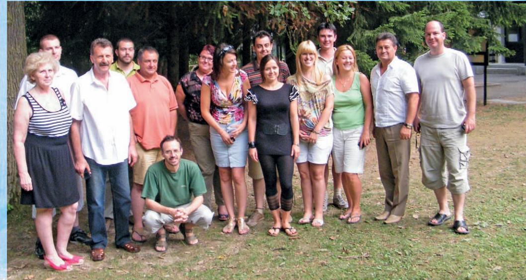
Representatives of the EGTCs at the workshop in Salgóbánya

We give a detailed report on the 2012 activities in the followings.