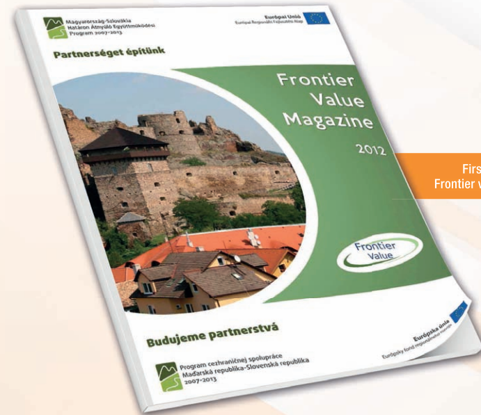
First volume of the Frontier value magazine

Our bilingual e-newsletter restarted in October. It is published in every two months and the registered partners receive it automatically. Permanent columns: internal news (news on the operation of CESCI), EGTC (news from Hungary and the European Union related to EGTCs), EU news, bibliography (introduction of professional materials published on cross-border issues).