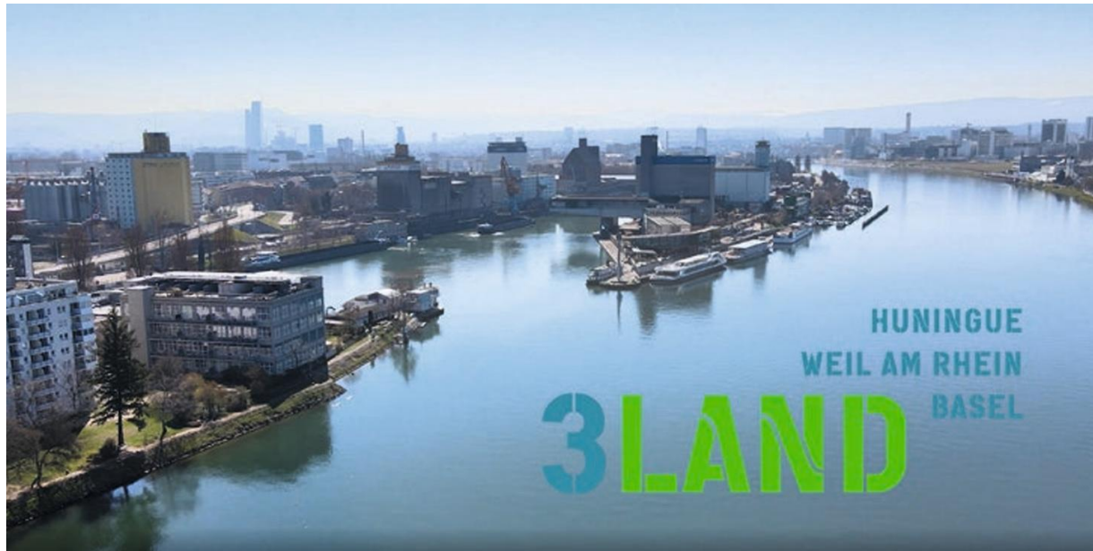
Exemple of a project conducted by the Landkreis Lörrach >

> Exemple of a project coordinated by the ETB