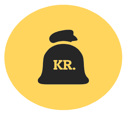
8800 billion GDP