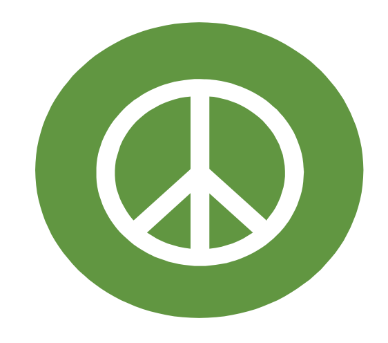
The world's most peaceful region