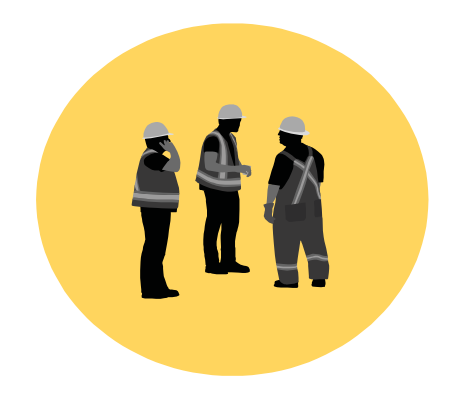
12,5 million employees