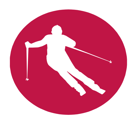
No. 1 in Winter Olympics