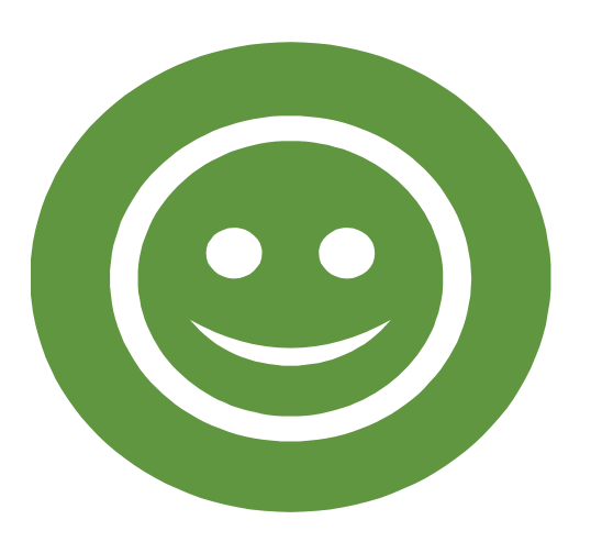
The world's happiest population